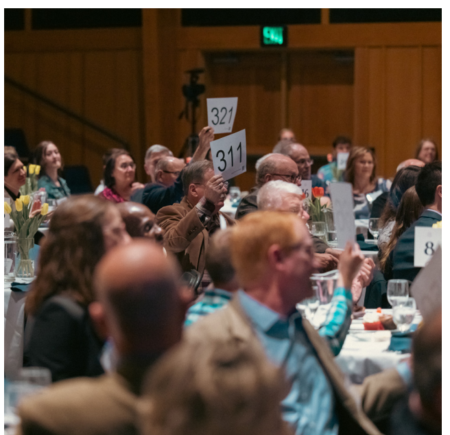
Attendees participate in the paddle-raise auction