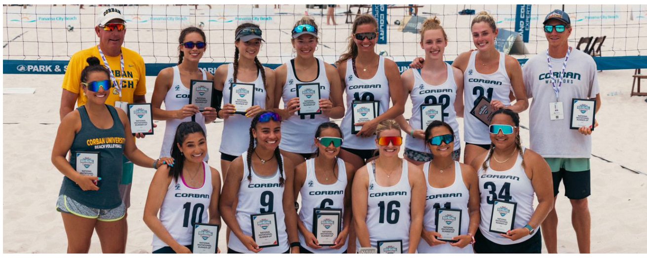
Corban's beach volleyball team with their national runner-up trophies

Another successful season for the nationally-ranked Corban beach volleyball team came to a close in mid-April at the NAIA National Invitational, where the Warriors once again made an appearance in the National Championship match.