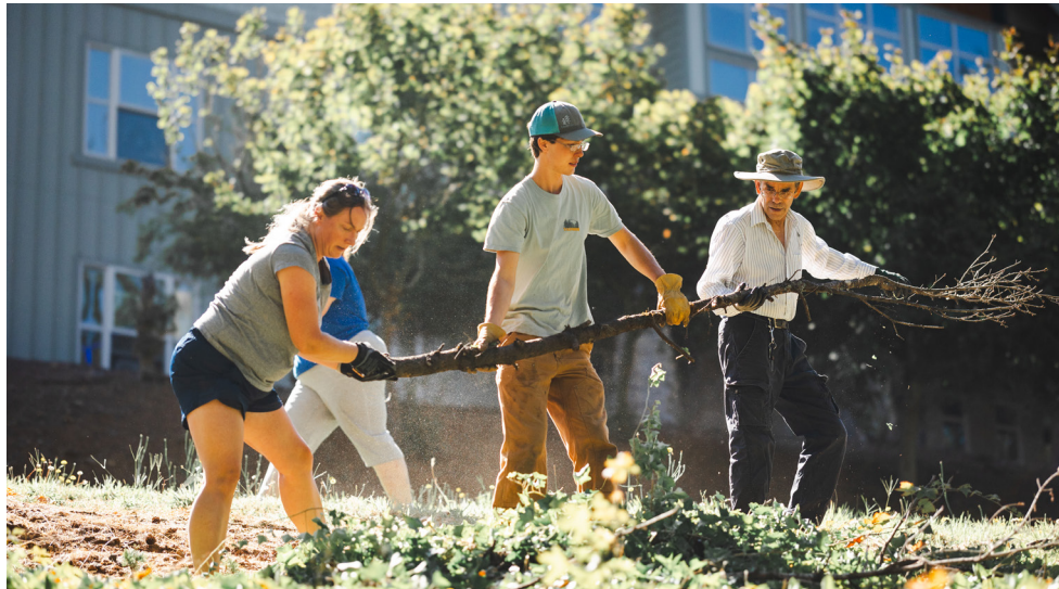
Volunteer work crews ready Corban's campus for new students

Thank you to everyone who participated, served, sweated, pruned, and prayed during Volunteer Work Week. You are a blessing to our students, and this community.