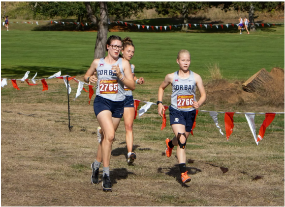
The women’s cross country team runs together