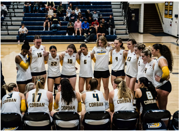
The volleyball team strategizes in between sets

The Corban indoor women’s volleyball team led all Navy and Gold squads with a 3.70 cumulative GPA in 2024-25 while women’s cross country finished in second at 3.68 overall. Following indoor volleyball and women’s cross country was indoor/outdoor women’s track & field (3.59), women’s basketball (3.56), and women’s beach volleyball (3.52) to round out the top five GPAs within the Corban athletic department. Over 73% of Warrior athletes qualified for the Academic All-Conference requirements last year, the best mark in school history, and thus qualified the University for President’s Cup status from the CCC office once again.